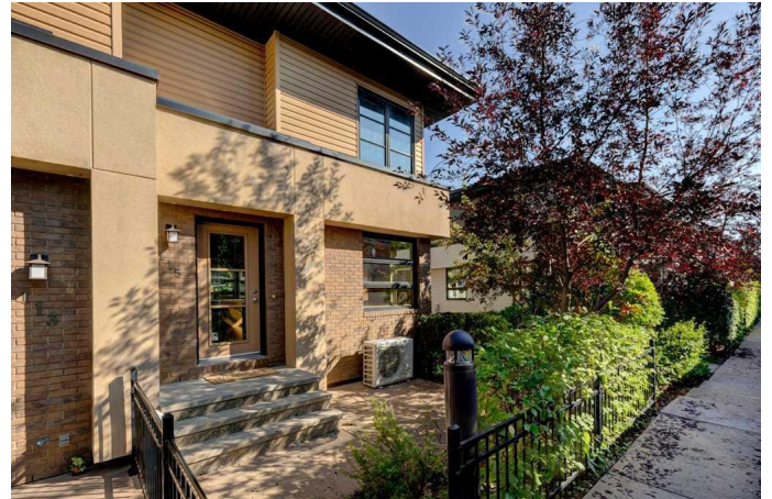
115 Aspen Hills Villas SW, Calgary, AB

Welcome to this meticulously maintained end-unit townhouse, an exceptional find in the highly desirable Mosaic of Aspen Hills. Its prime location, coupled with contemporary upgrades and an abundance of natural light, makes it a standout in the community. From the moment you arrive, the inviting front courtyard—perfectly positioned on the southwest corner of the complex—greets you. This charming outdoor space offers an ideal setting for relaxing afternoons and stylish outdoor entertaining. Step inside and experience the spaciousness of this sun-drenched end unit. The main floor impresses with gleaming hardwood floors, oversized windows (a hallmark of the end-unit design), and an open-concept layout that accommodates both everyday living and hosting guests. The kitchen is a chef's dream, featuring custom cabinetry with motion activated under-cabinet lighting, a large central island with elegant granite countertops, and a designer automatic kitchen faucet. A generous pantry and a breakfast nook/flex space offer versatility, perfect for a casual dining area or home office. Adjacent to the kitchen is the central dining area and a bright, expansive living room, bathed in the warmth of south and west-facing sunlight. A convenient half bath completes this level. Ascend the stairs—illuminated by sleek Wyz-controlled LED lighting—to discover the upper level, where two spacious primary suites await. Each bedroom is thoughtfully designed with large