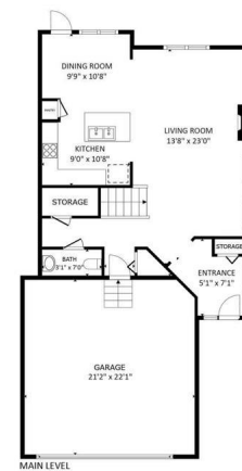
119 Cimarron Vista Crescent - Okotoks MAIN LEVEL: 813.5 SqFt, GARAGE: 491.5 SqFt