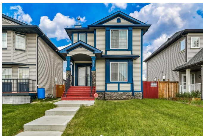
1025 Taradale Dr NE, Calgary, AB

1st Floor Exterior Area 749.25 sq ft Interior Area 653.97 sq ft