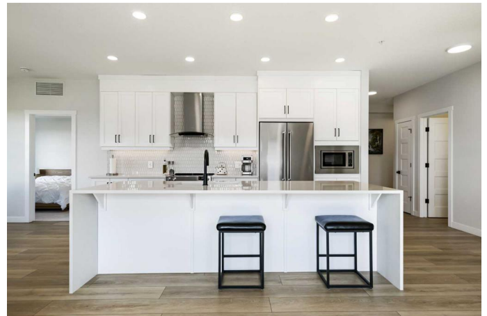
312, 55 WOLF HOLLOW CRESCENT SE REC-MEASUREMENT STANDARD - CALGARY AB MAIN LEVEL (AG) - 1134.96 Sq Ft. / 105.44 m² TOTAL ABOVE GRADE RMS SIZE - 1134.96 Sq Ft. / 105.44 m²

You know that feeling when you are on holidays? When you walk into your high end hotel room and take a big deep breath and then a huge sign of contentment resting your gaze on immaculately maintained and gorgeous surroundings? Then you take a step out to your over sized and spacious balcony to sit down and enjoy the golden hour and wonderful view, all the while thinking...I could live here. Well...here's your chance! Welcome to the Bow360 at Wolf Willow where you are invited to explore almost 1200sqft of luxury living. This stunning CORNER UNIT overlooking the greenspace and park will invite you in and have you feeling like you are in vacation mode immediately upon entering. The 9ft ceilings and spacious foyer opens up to a thoughtfully designed open floor plan that introduces you to TWO BEDROOMS plus DEN complimented with 2 FULL BATHS showcasing stunning black hardware with a professionally designed interior colour palette. Designed by award winning architects S2 you will enjoy the expansive living room with beautiful feature fireplace with floor to ceiling stone and luxury vinyl plank flooring through out the main living and designated dining area which is situated overlooking the deck and greenspace. Corner lot window treatments gives you additional over sized windows that are framed in by custom window treatments and the radiant heating keeps you nice and cozy during the cooler months while the central air vented through out the entire unit