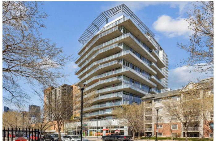
506 624 8 Ave SE - 04/17/2025 Main - 648.16 sq.ft/ 60.21 m2 RMS Area - 648.16 sq.ft/ 60.21 m2