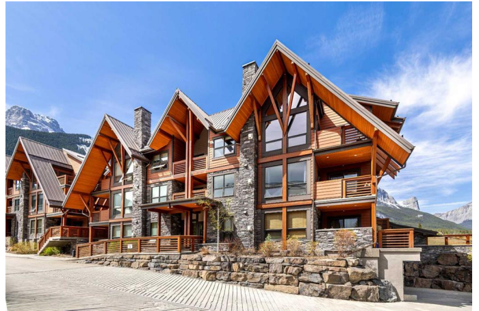
204C-2100 Stewart Creek Dr, Canmore, AB

Secure storage locker conveniently located next to parking